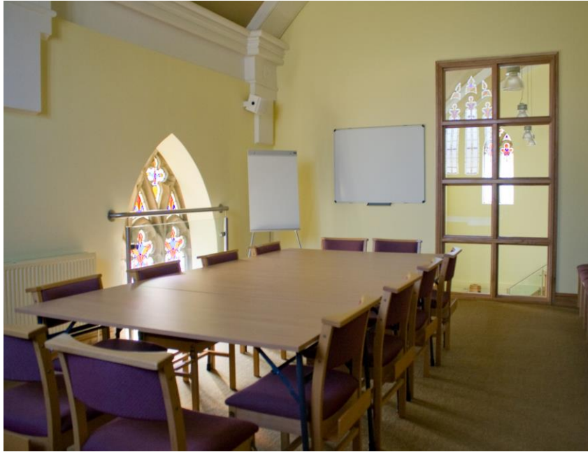
Victoria Park Room (7.3m x 3.7m) – Upper Floor