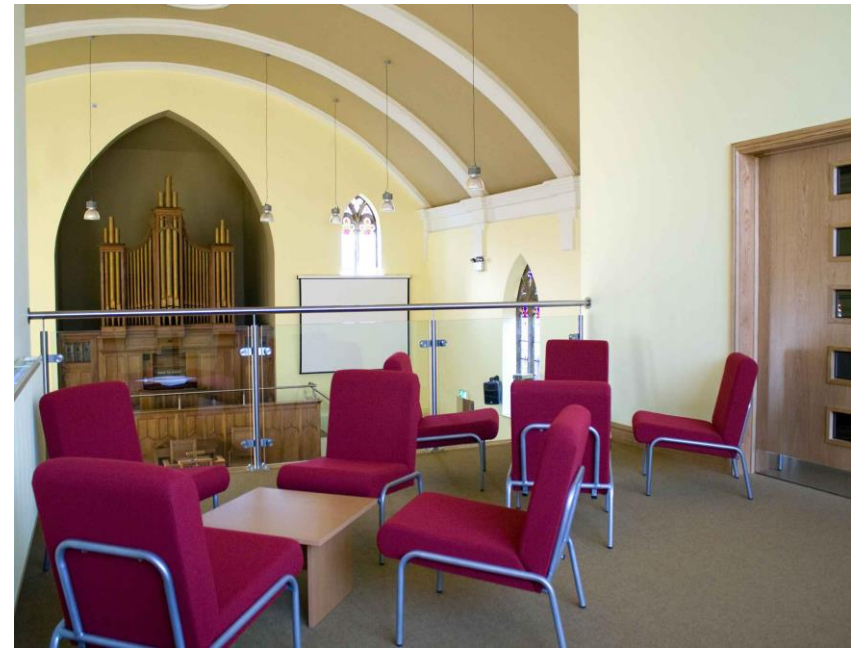
The Balcony – Upper Floor